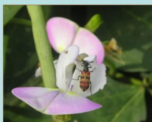
Hausa - hangara Français – Mylabres Scientifique – Mylabris senegalensis

Bunsuru yana rayuwa kwana 14 zuwa kwana 18, yana sakin kwai shin ciki hure. Bayan sun girma za su bata huren. Ana iya kashe shi da maganin zamani ko na gargajiya.