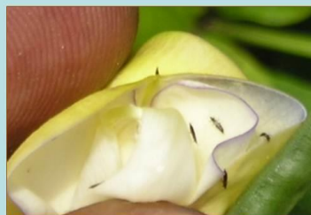
Hausa - Bunsuru Français – Thrips Scientifique – Megalurothrips sjostedti

Bunsuru yana rayuwa kwana 14 zuwa kwana 18, yana sakin kwai shin ciki hure. Bayan sun girma za su bata huren. Ana iya kashe shi da maganin zamani ko na gargajiya.