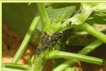
Hausa – ‘Dan Maski ko Darba Français – Les Pucerons Scientifique - Aphis craccivora

1 Institut National de la Recherche Agronomique du Niger, BP 429 Niamey Tél: +227 20 72 27 80 Email: inran@intnet.ne ou dginran@yahoo.com ; 2 Peace corps, B.P. 10537, Niamey, Niger 3 Direction Régionale de l'Alphabétisation de Maradi, Tél: 96897035 Email: massaoudougamba@yahoo.fr 4 Department of Entomology, University of Illinois at Urbana Champaign, IL, USA