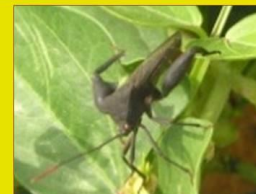
Hausa – baki karbobo Français –Punaise noire Scientifique – Anoplocnemis curvipes

Wannan kwarin masu suna karbobo suna rayuwa kwana 24 zuwa kwana 84. Karbobo yana iya kashe wake cikin kwafsarshi saboda yana shan ruwan wake daga tsanwa kwafsar. Ana iya kashe karbobo da maganin zamani ko na gargajiya.