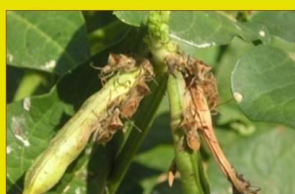
Hausa – karbobo Français – Punaise brune Scientifique – Clavigralla tomentosicollis