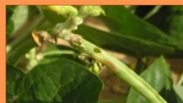
Hausa - Tsutsar Malam Batata Français –Larve Maruca

Malam Batata ne ke bada wanan tsutsar da ke cin hure da Kwafsa. Yana rayuwa kwana 7 kuma yana sakin har kwai 150 bisa hure da Kwafsar wake.