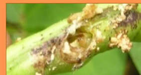
Hausa - tsutsar Malam Batata Français – Larve Maruca

Ana iya kashe Malam Batata da maganin zamani ko na gargajiya.