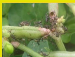
Hausa - yaya Français –jeunes punaises brunes Scientifique – Clavigralla tomentosicollis

Wannan kwarin masu suna karbobo suna rayuwa kwana 24 zuwa kwana 84. Karbobo yana iya kashe wake cikin kwafsarshi saboda yana shan ruwan wake daga tsanwa kwafsar. Ana iya kashe karbobo da maganin zamani ko na gargajiya.