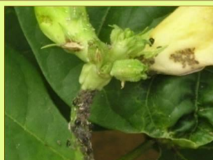
Hausa - kanaan darba Français – jeunes pucerons Scientifique - Aphis craccivora

Dan Maski ko Darba yana rayuwa kwana 6 zuwa kwana 15 kuma yana aihuwa kimanin diya 100. Darba tana kasar tohon wake kuma ana samunta cikin tushe da huren wake. Wake yana iya samu matsala daban- daban saboda Darba, amma akwai wani irin wake wanda ke jimre ma Darba. Ruwan sama yana rage Darba in ana yinsu kai a kai kuma ana iya aiki da maganin gargajiya ko na zamani.