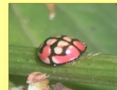
Hausa - Mai dashi bakwai ja Français - Coccinelle Scientifique – Cheilomenes sulphurea

Mai dashi bakwai ja tana daya daga cikin kankanan kwarin da ke taimaka ma wake saboda yana cin Darba.